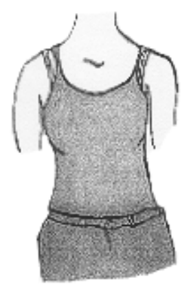
Visible Undergarments & Spaghetti Straps