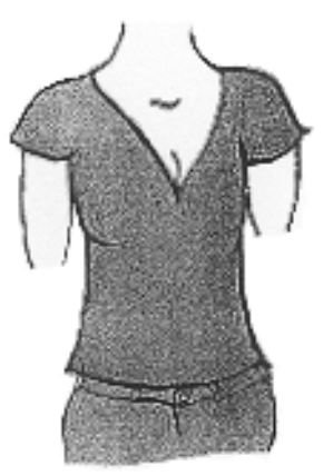
Low Cut Top