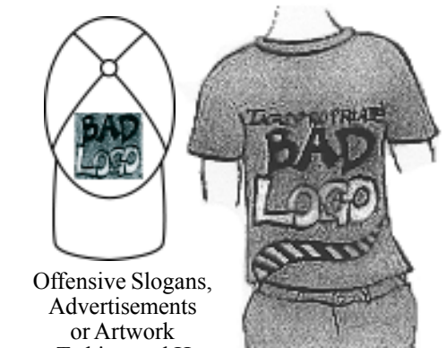
on T-shirts and Hats